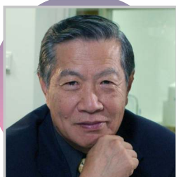
Dr. Henry C. Lee

Emeritus Professor & Vice President Institute of Forensic Science University of New Haven, USA